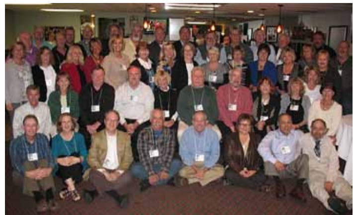
The Class of 1970 enjoyed a 40<sup>th</sup> reunion weekend with a recent get together at the Knotty Pine one Friday night followed by a party at the Columbus Italian Club